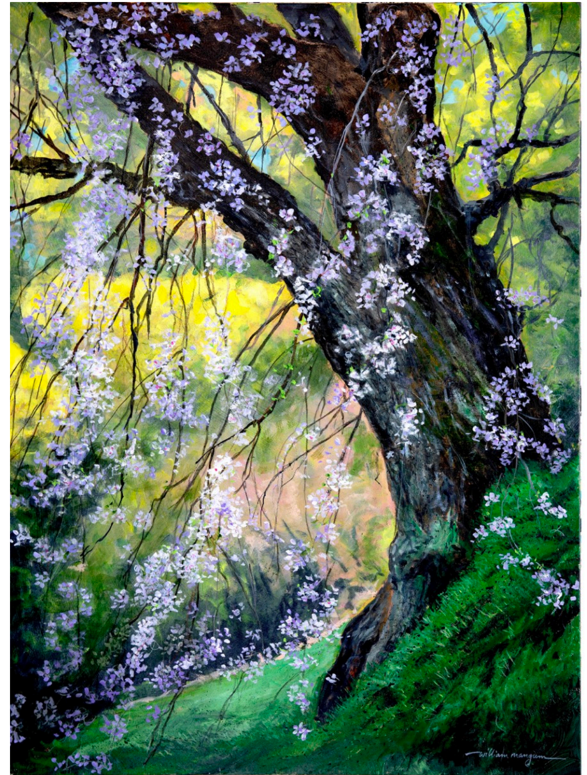
40 x 30 Rare Beauty $3250