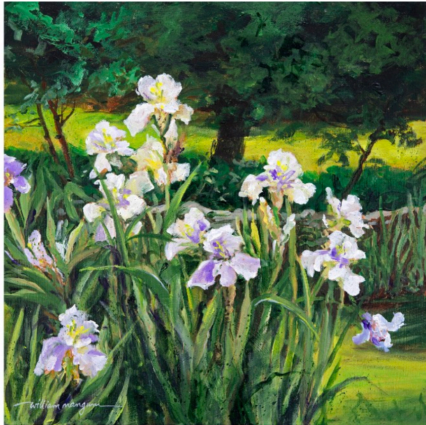
20 x 20 Fond Memories $1850 / SOLD