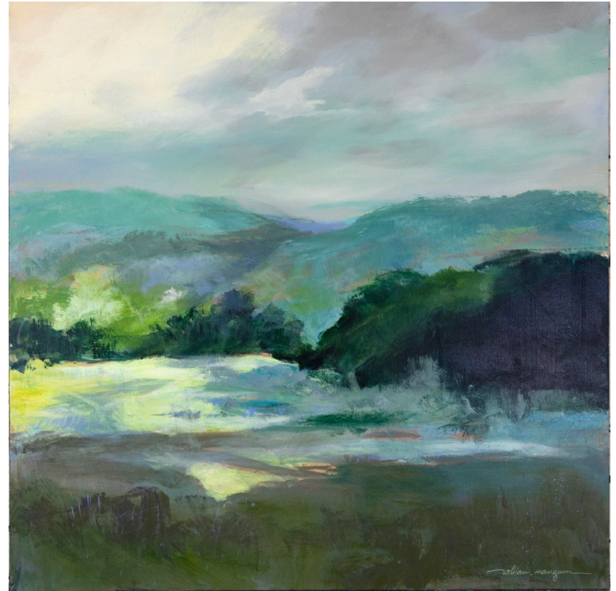
36 x 36 Along the Way $3500 / SOLD