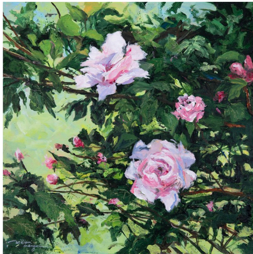
20 x 20 Nestled in Light $1850