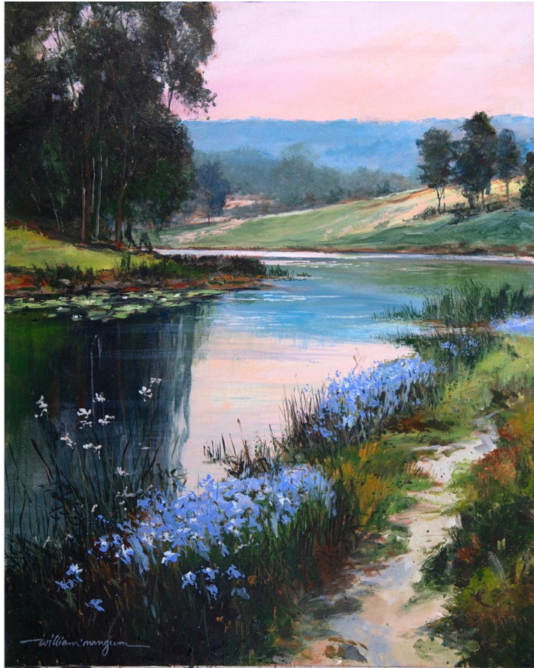
30 x 24 Another Long Evening $2500 / SOLD