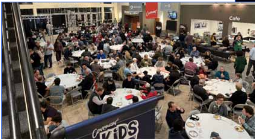
Almost 300 men ate dinner together on Friday night.