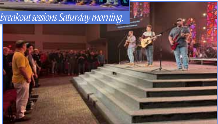
Worshipping the Lord together Friday evening & Saturday morning.