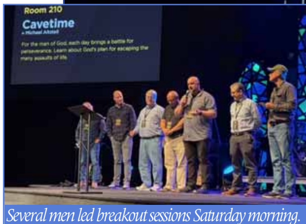
Several men led breakout sessions Saturday morning.