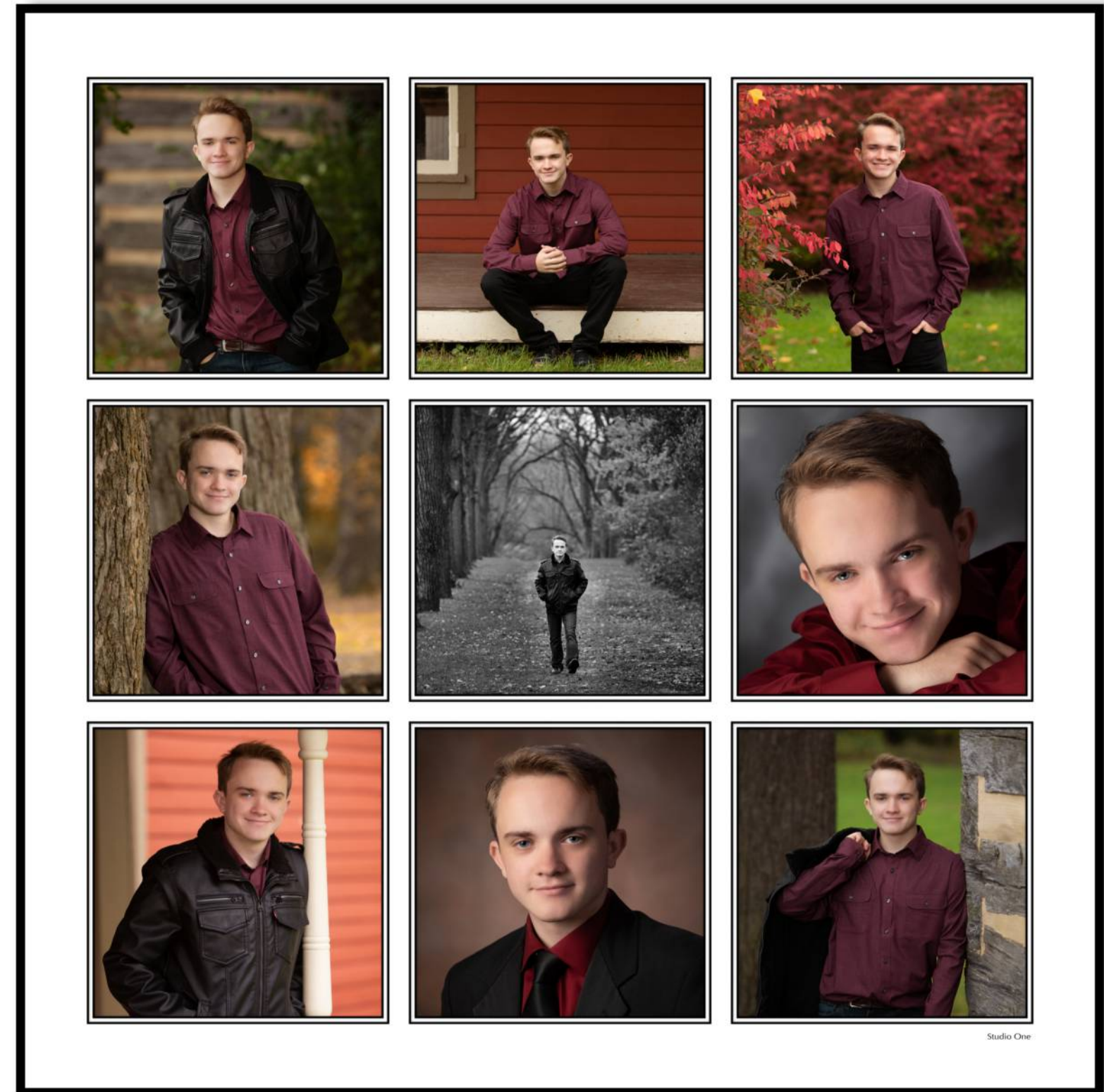
Class of 2022 Hanover-Horton High School