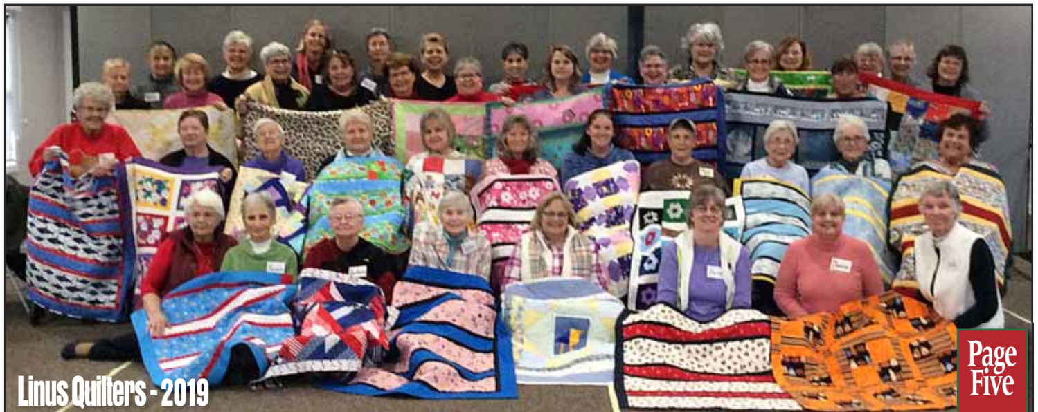
Linus Quilters - 2019