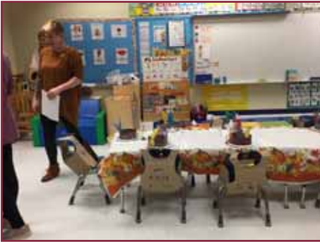
Tutoring at Kitty Hawk Elementary