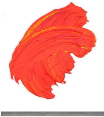
Donald Martiny, Alanic , 2014, polymer and dispersed pigment on aluminum, 55 x 44 inches ©2014 Donald Martiny