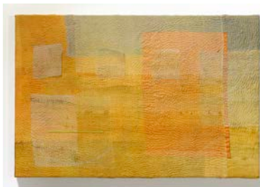
Carolyn Nelson, Aurora , 2015, hand stitched textile collage, hand dyed shibori silk and thread, 36 x 24 inches ©2015 Carolyn Nelson